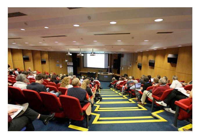
ICTMA17 - Plenary session

The team who organised the conference in Nottingham would like to express how much they appreciated all of the positive feedback they received and how much they enjoyed hosting the ICTMA family. It was great to see so much energy and enthusiasm not only in the dancing but also during the sessions of the conference. The ICTMA really is a great community to be part of and we all look forward to meeting old and new friends in South Africa in 2017.